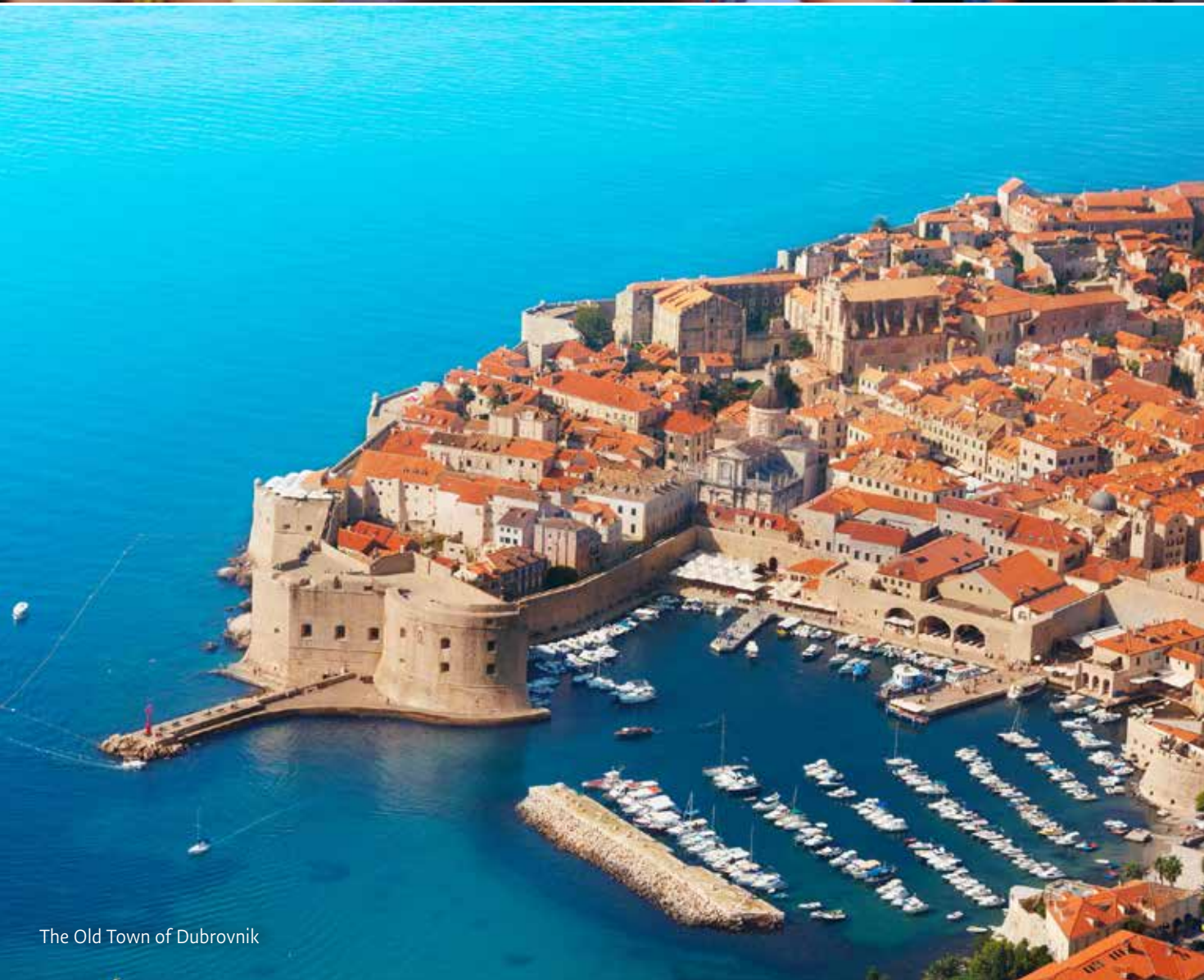
The Old Town of Dubrovnik