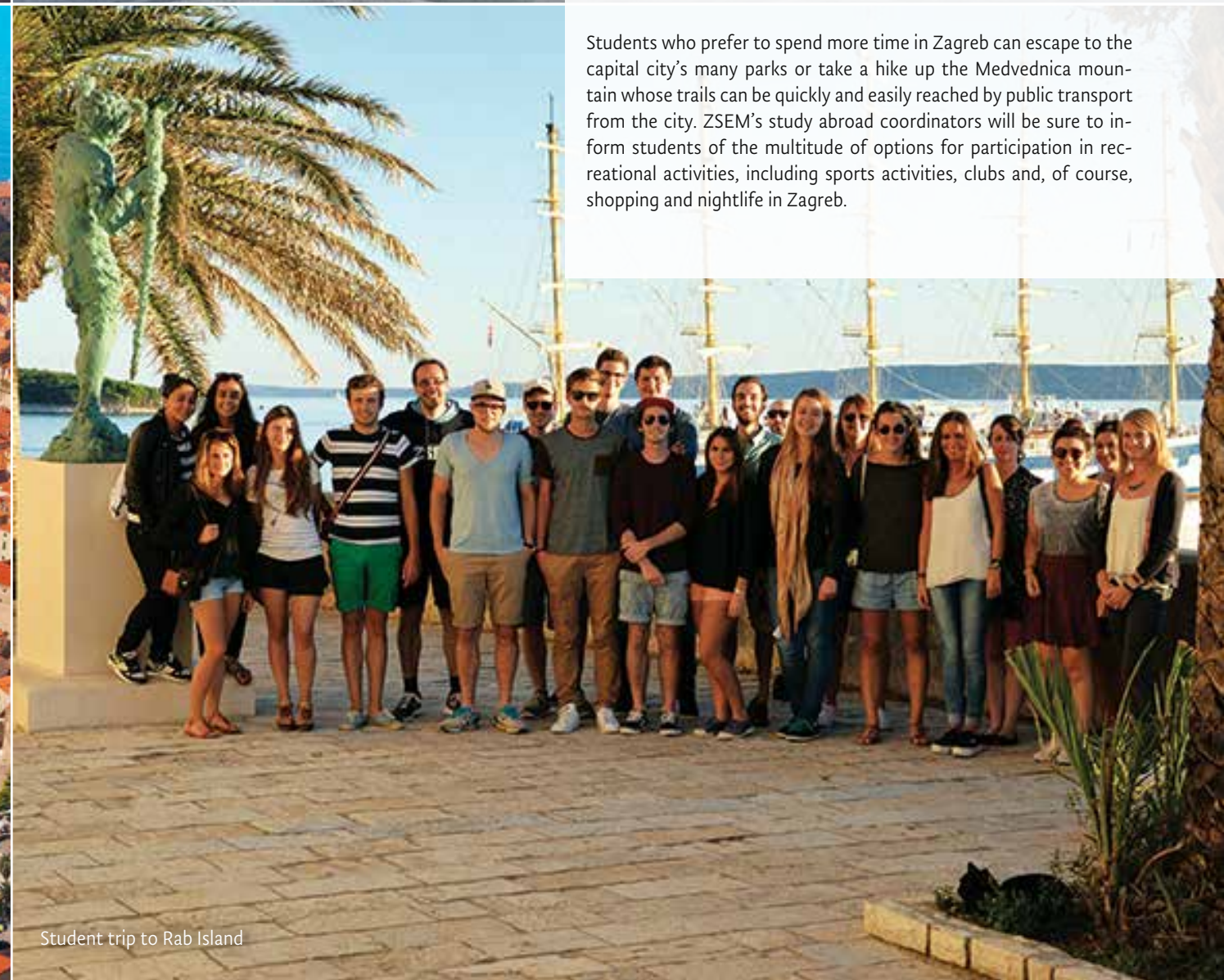
Student trip to Rab Island

Students who prefer to spend more time in Zagreb can escape to the capital city's many parks or take a hike up the Medvednica mountain whose trails can be quickly and easily reached by public transport from the city. ZSEM's study abroad coordinators will be sure to inform students of the multitude of options for participation in recreational activities, including sports activities, clubs and, of course, shopping and nightlife in Zagreb.