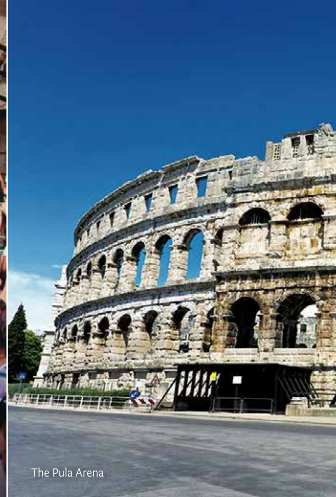
The Pula Arena

During this study abroad program, students will not only experience quality learning in an international setting, but they will also have the opportunity to immerse themselves into the Croatian culture and explore Croatia's history and stunning landscape. Sightseeing tours and trips will also be organized in Zagreb (Croatia's capital and the location of ZSEM) and also to smaller cities and towns surrounding Zagreb. Students will have the opportunity to visit old castles near Zagreb, various museums, the medieval Upper Town, the Zagreb Cathedral and other localities. Because of Zagreb's prime location in the heart of Croatia, students will be able to take various organized or independent weekend excursions or day trips to: